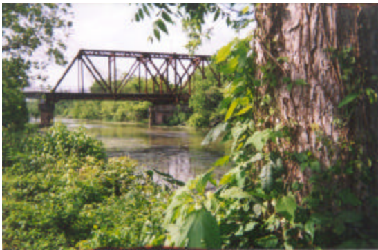
"Beauty of the Bayou"