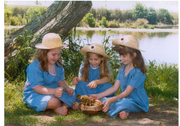
"Happiness in Nature"