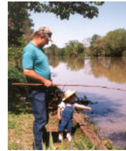
“Grandpaw and Grandson”

We appreciate your participation. For more information and free educational products, please visit our website at http://educators.btnep.org or call us at 800 259-0869.